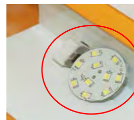
LED 10/30 20W AC/DC